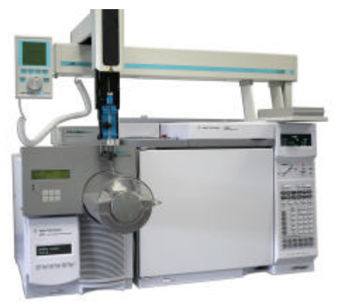
Figure 2: Agilent MSD 5975 with DIP, GC and CombiPal autosampler

To improve the efficiency and save even more time, the DIP can be operated in combination with a PAL autosampler. Together with the special DIP/PAL accessories automatted analysis of liquid and solid samples is possible.