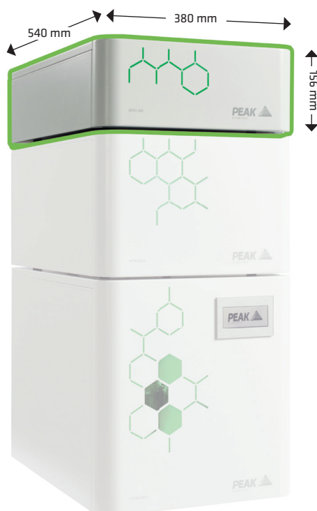
Zero Air 1.5L/3L unit size pictured in a typical Precision stack.